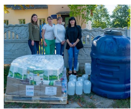
Institutional hygiene kits delivered in Vinnytsia

The WASH Cluster Technical Cell has been conducting outreach for a pilot organized for October to define a WASH coordination structure bringing humanitarian and stabilization/development actors together with local authorities. September also saw the Water Quality Technical Working Group promote technical exchange among partners on water quality testing and on experiences with administrative processes of borehole development and rehabilitation, building on recently developed guidelines.