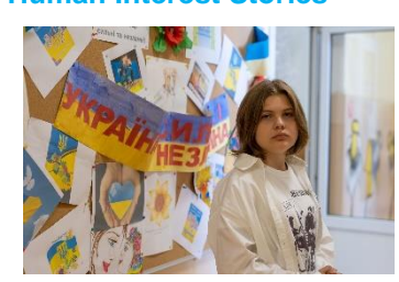
After fleeing abroad, children return to school in Kyiv