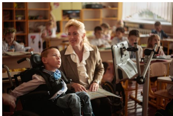
Child using eye-tracker provided by UNICEF.

UNICEF has rehabilitated 80 schools and kindergartens across Ukraine and added shatter resistant film to the windows of 43 educational facilities. This has allowed 70,000 girls and boys access to full-time education in the 2023/2024 academic year. To enhance the learning experience of both student and educators, UNICEF has distributed educational supplies , including ECD kits, individual education kits for children and other resources, for 34,970 children. A total of 439,596 children have been supported with education supplies since January 2023.